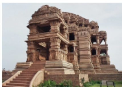
Saas Bahu Temple