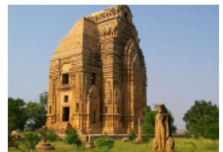
Teli K Mandir