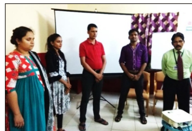
Participants experiencing state of "MEDITATION" at J. P. Biscuits, Umargaon (Gujrat)