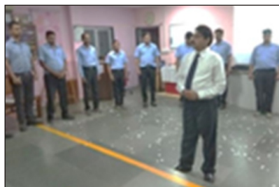
Practical Exercise on Mind relaxation, at Parle Biscuits, Khopoli