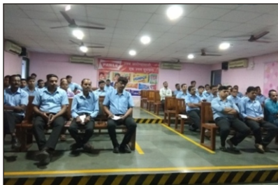
Training on TPM OF MIND at Parle Biscuits, Khopoli