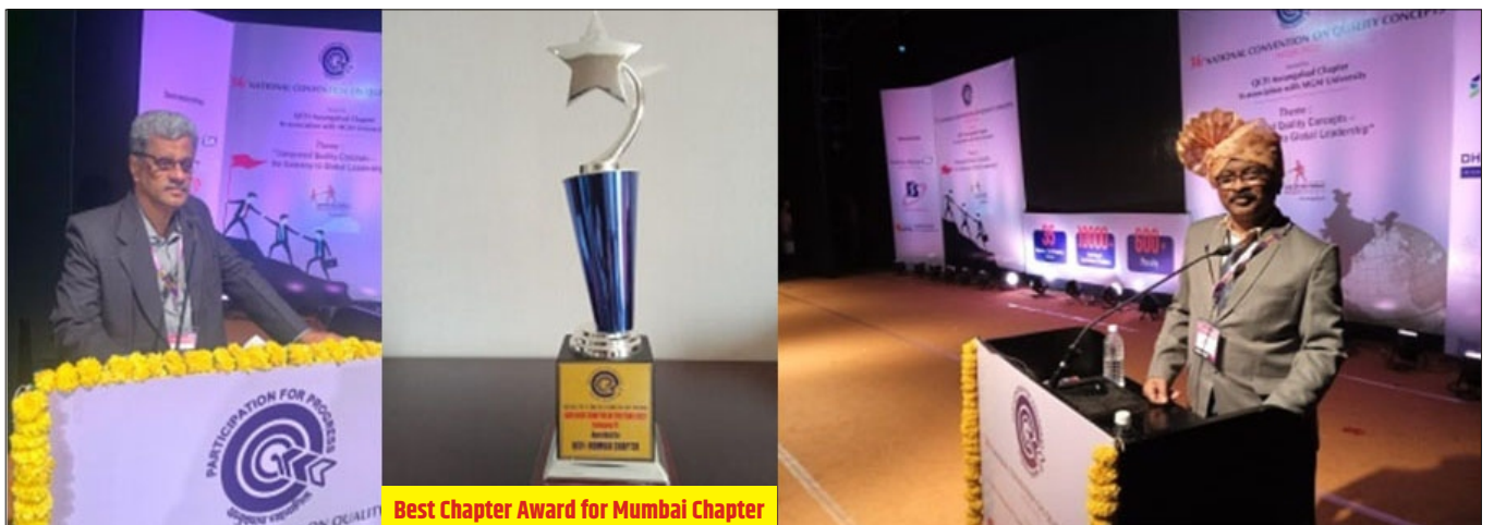
Best Chapter Award for Mumbai Chapter